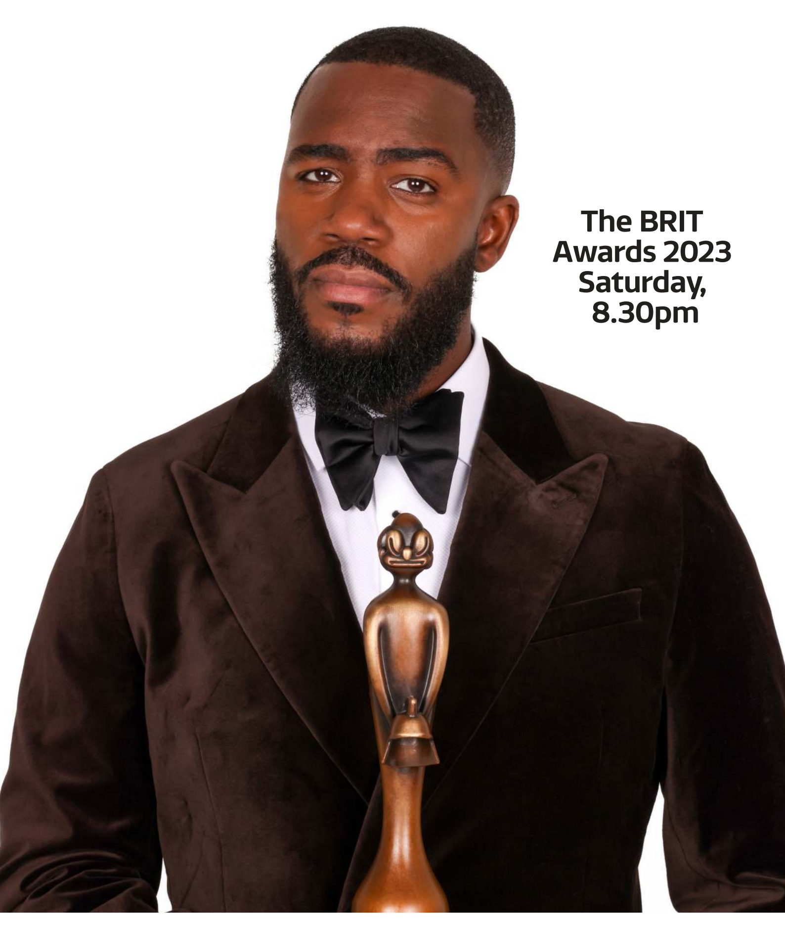
This information is embargoed from reproduction in the public domain until Tue 7th February 2023.

Week 06/07 - Saturday 11th - Friday 18th February 2023