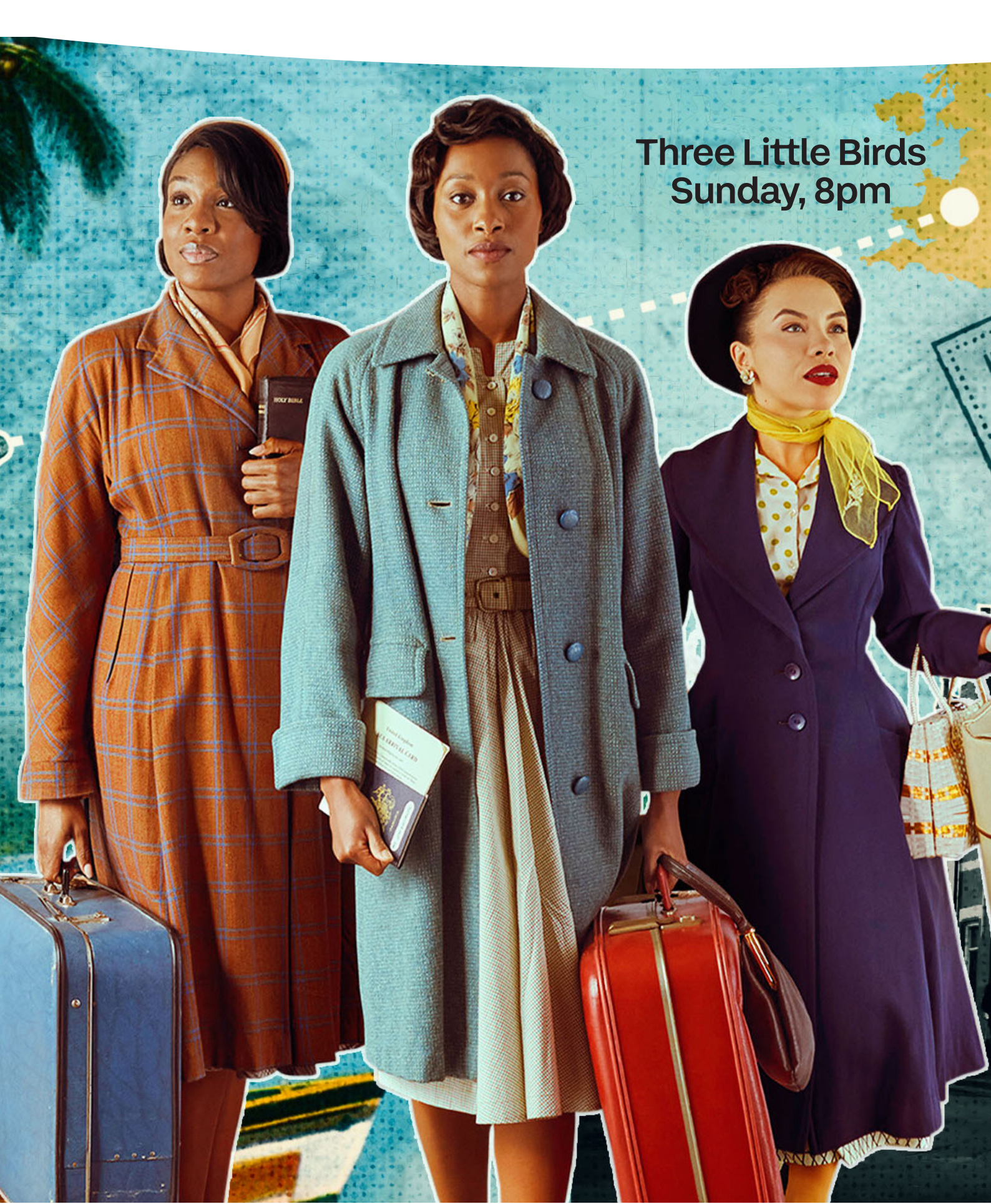
This information is embargoed from reproduction in the public domain until Tue 17th October 2023.

Week 42/43 - Saturday 21st - Friday 27th October 2023