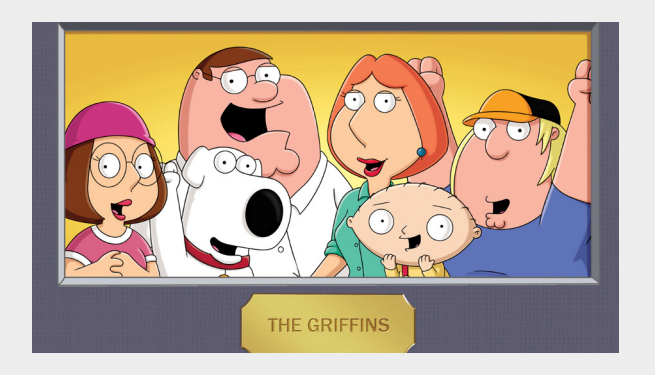
Family Guy Monday, 9pm 27th November ITV2

A dysfunctional family in a wacky Rhode Island town strive to cope with everyday life as they are thrown from one crazy scenario to another in this animated sitcom.