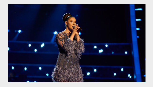
The Voice UK Saturday, 8pm 25th November ITV1

This reality talent show allows thousands to audition, but only one can win as the search is on for the next singing superstar - who will win an incredible record deal?