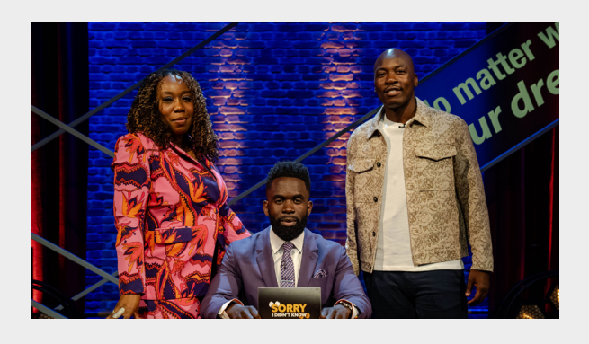
Sorry, I Didn't Know Sunday, 10.55pm 10th December ITV1

Jimmy Akingbola hosts the comedy panel show with a twist that takes a tour of Black history across the globe in an insightful take on history with a touch of colour.